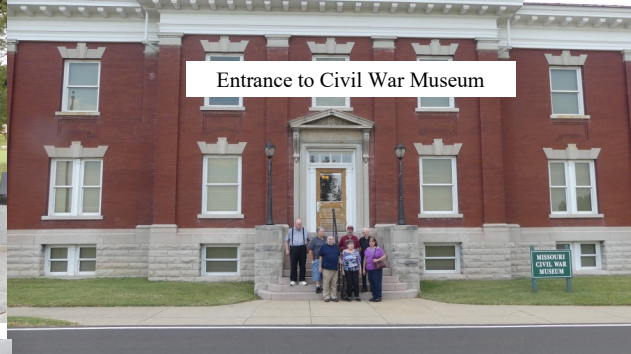
Entrance to Civil War Museum