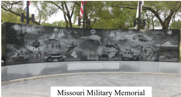
Missouri Military Memorial

On Saturday, October 5, 2019 members of St. Louis Lodge No. 5 and their guests visited the Missouri Civil War Museum located at the historic Jefferson Barracks. The visit was not only a look into our past, but a history lesson into the people involved. This Museum is dedicated to preserving the artifacts that were used during the Civil War. The staff was great and very knowledgeable.