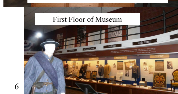
First Floor of Museum