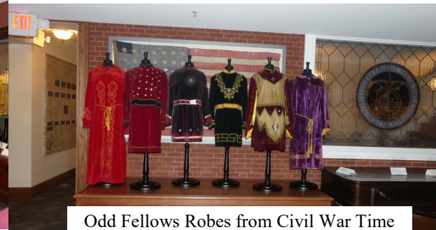
Odd Fellows Robes from Civil War Time