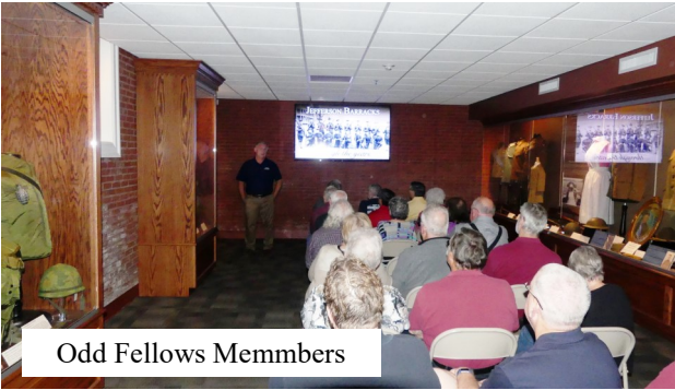
Odd Fellows Memmbers