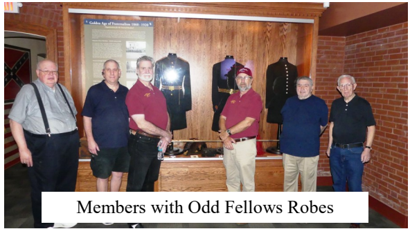
Members with Odd Fellows Robes